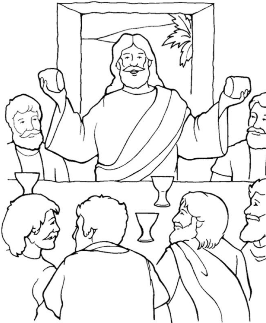
The Last Supper

FromThru-the-Bible Coloring Pages for Ages 4-8. © 1986,1988 Standard Publishing.